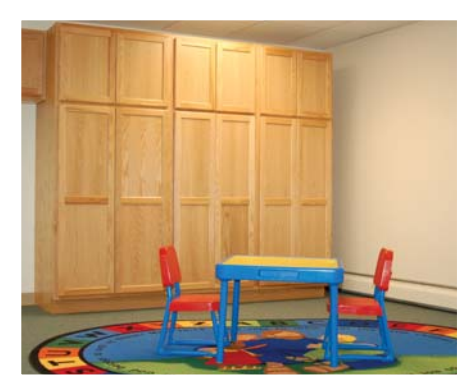
A bright, new room for our children

Children's Ministry Open House Sunday, October 26 12:15 PM