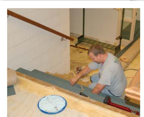
Carpet going in at the new main entrance to the Children's Ministry area